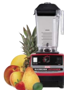
Vita-Mix BarBoss Advance